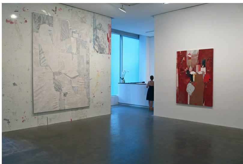
Installation View: Susan Inglett Gallery, New York, NY 2016

As the gallery has evolved, I've been able to do shows with people that I looked up to, who used to be total strangers. By doing it for a long time, they kind of came into the orbit of the gallery one way or another. That made it easier to reach out to them, without it being a total cold call.