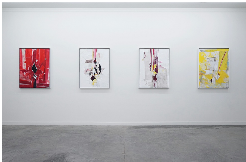
Installation View: Romer Young Gallery, San Francisco, CA, 2017

Yeah, it's energizing for sure. While my wires do get crossed, the gallery has served that role for me as an artist because I never really liked networking. That's the thing that gets weird about it. Are you there to show support, or are you there to network for yourself at someone else's opening? If it's the latter, that sucks. So for me, I was able to remove myself from talking about myself, because I have to go out and do these things on behalf of the artists I work with. As a result, that gets me out there more.