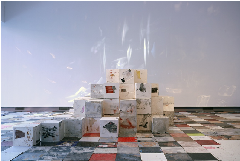
Installation View: ICA at MECA, Portland, ME, 2018

I totally understand that. I'm kind of a robot in those things, though. The big difference between the two studios is completely practical. I had an idea for these sculptures that I couldn't do here, because my studio's not that big and I can't make a total mess. Out there, I can fucking trash the place and it doesn't matter, because it's a barn that's going to get torn down. I'm also more likely to make 10-foot paintings out there than in my New York studio, because here, I can't get them down the stairwell. It's things like that. I just look for opportunities that I can't exploit elsewhere, and run with them.